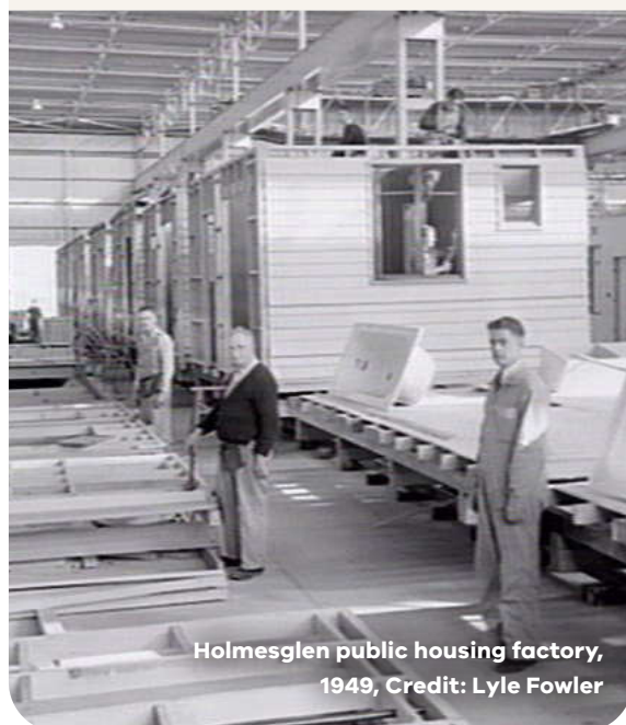
Holmesglen public housing factory, 1949, Credit: Lyle Fowler

Our high-rise towers have stood strong for nearly 70 years, but they are now approaching the end of their operational life. The 44 towers were built with outdated standards of thermal comfort, sustainability, noise insulation, ventilation, and accessibility. After considered review, we have found that the towers are not suitable for renovation.